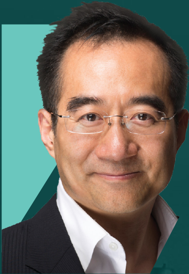
//Prof. Joseph Kan

Vertical tissue regeneration in the esthetic zone: science, art & limitations often considered somewhat mythical in nature, vertical tissue regeneration in the esthetic zone inspires awe in even the most skilled of surgeons. What do we as clinicians think we know about it? What do we as a scientific community actually know about it? and perhaps most importantly, what do we not know?